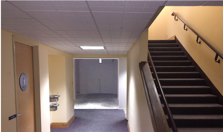
The downstairs Children's Wing hallway expanded to include the new elevator and access to Fellowship Hall via the back alley.