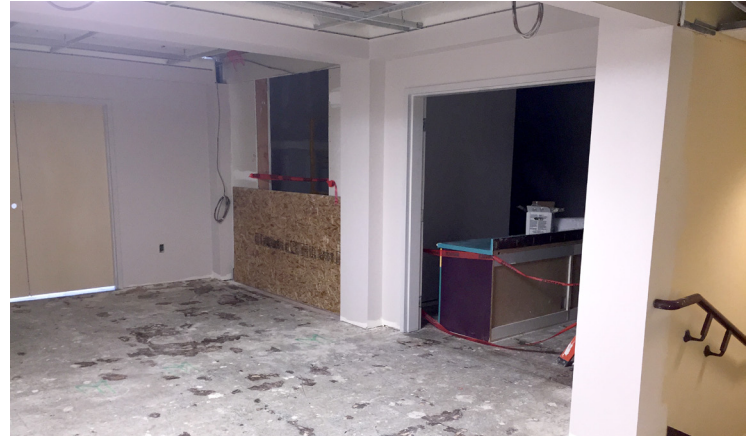
The upstairs Children's Wing features the top of the elevator shaft, and will house a new Sunday School check-in counter.

During the past several months a lot of work has been going on in our Children's Wing that has not been visible. An elevator is almost ready to be installed and the organ vaults on the north side of sanctuary are being finished up. As you may also be aware the organ console and all of the pipes have also been removed.